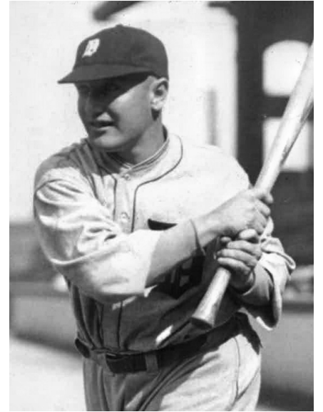
Legendary baseball man Fred Haney