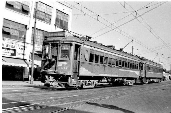
The Pacific Red Car rolls through our streets in the 1940s.