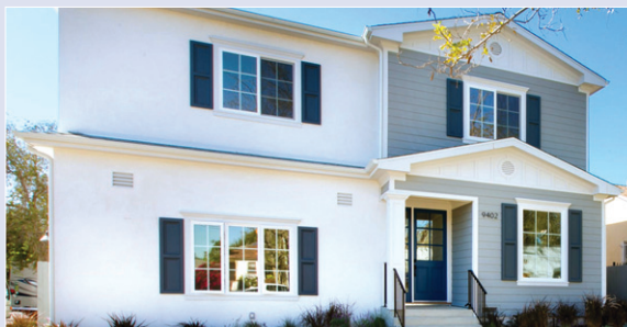
9402 Hargis Street – $2,399,000

Brand new construction on a lovely street in the Beverlywood neighborhood, this 3,043 sq ft, 5 bedroom/5 bath traditional style home is tailor made for an active family who appreciates design and function. Blonde-hued wood floors and high ceilings set the framework for the home, providing it with an airy sense of space and light. The ultra stylish kitchen was built with a culinary enthusiast in mind: stainless top-of-the-line appliances, oversized quartz island with Farmhouse sink and designer light fixtures, butler's pantry with extra storage and enormous pantry. The kitchen opens to the dining room and great room creating one vast space with a variety of functions. Glass doors from the great room