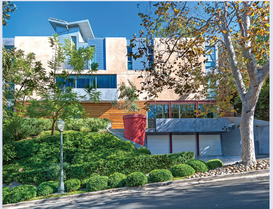
2788 Monte Mar Terrace – $7,500,000

*SQUARE FOOTAGE FOR THE HOUSE PER ASSESSOR IS 7,473. PER OWNER SQUARE FOOTAGE PER AN INDEPENDENT APPRAISER IS OVER 9,000 INCLUDING GARAGE. BUYER IS TO RELY ON THEIR OWN DUE DILIGENCE AND USE OF LICENSED PROFESSIONALS FOR DETERMINATION.