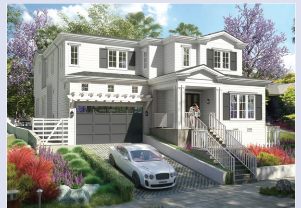
2235 S Beverly Dr. –