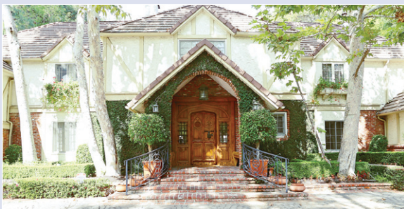
15921 Royal Oak Road – $5,500,000

A traditional, Tudor style English manor on one of the most desirable streets in Encino, this massive yet tasteful property gives new meaning to the word impressive. Situated on an incredible 54,324 (a combination of 3 parcels), this 6 bedroom/7 bathroom stately mansion exudes a warm, southern charm mixed with old world sophistication. The ground floor offers a vast, formal living room with impossibly high ceilings, formal dining room with butler's pantry, wood paneled wine room, a bright conservatory/sun room, immaculate kitchen boasting appliances courtesy of Viking, Thermador and Subzero, and breakfast room with cozy brick fireplace. There is a den/study/library with wet bar