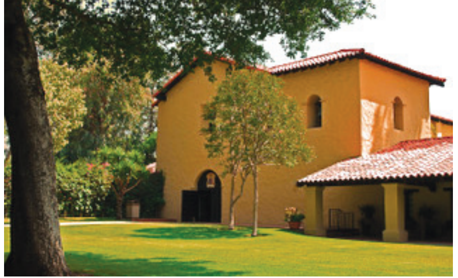
San Fernando Mission