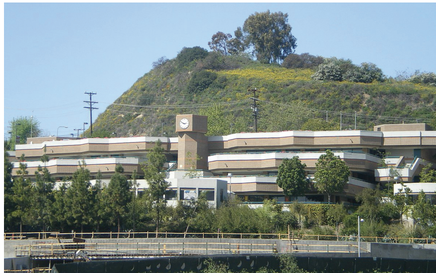
Stephen S. Wise Temple

Reformed Judaism (URHC) and the liturgy would be considered on the conservative side of reform practice.