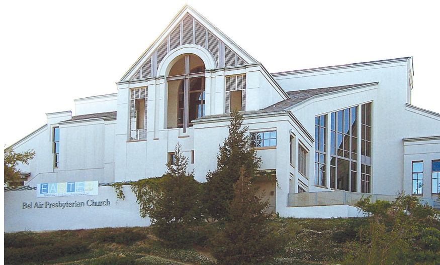
The Bel Air Presbyterian Church