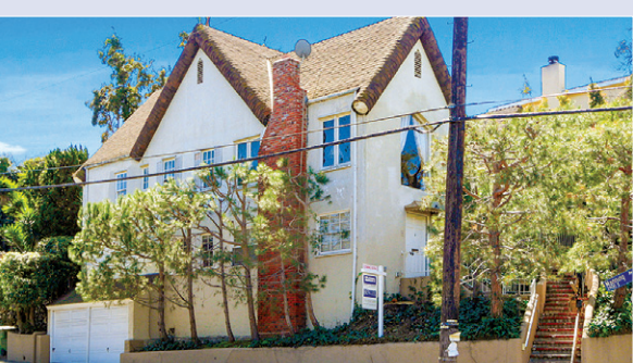
10552 Cheviot Dr - $1,499,000

4 Bed / 3 Bath 2,300 Sq. Ft., 6,505 Sq. Ft. Lot