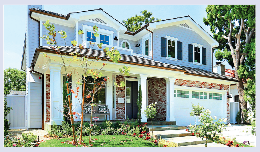
2715 Forrester Dr – $5,299,000 Great new price!

Cheviot Hills - ACTIVE! 5 Bed / 5 Bath 3,842 Sq. Ft., 7,444 Sq. Ft. Lot