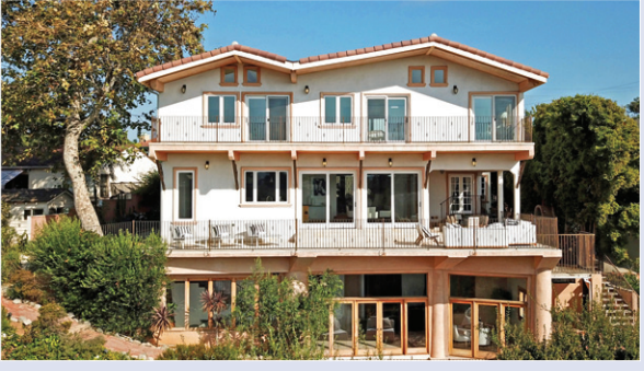
515 Muskingum Ave – $3,195,000 Great new price!

5 Bed / 4 Bath 4,100 Sq. Ft., 8,276 Sq. Ft. Lot