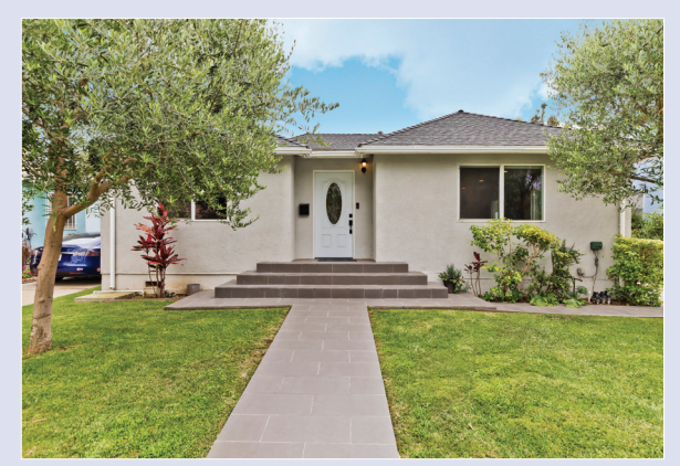
10756 Ashby Avenue Price-TBD 3 Bed / 2 Bath 1,920 Sq. Ft.

A classically stunning home in the highly coveted Overland Elementary School District offers an equal blend of flair and function. An open floor plan allows for a vast, airy space in the front of the house in which the formal living room, dining room and a variety of smaller seating areas all seamlessly flow together, leading toward the kitchen, always the busiest social hub of the home. Each of the bedrooms are spacious yet cozy with clean, updated bathrooms. Walking distance to the shops and restaurants of Pico Boulevard, Overland School and the Expo Line, this conveniently located and utterly delightful home will likely not be on the market for long.