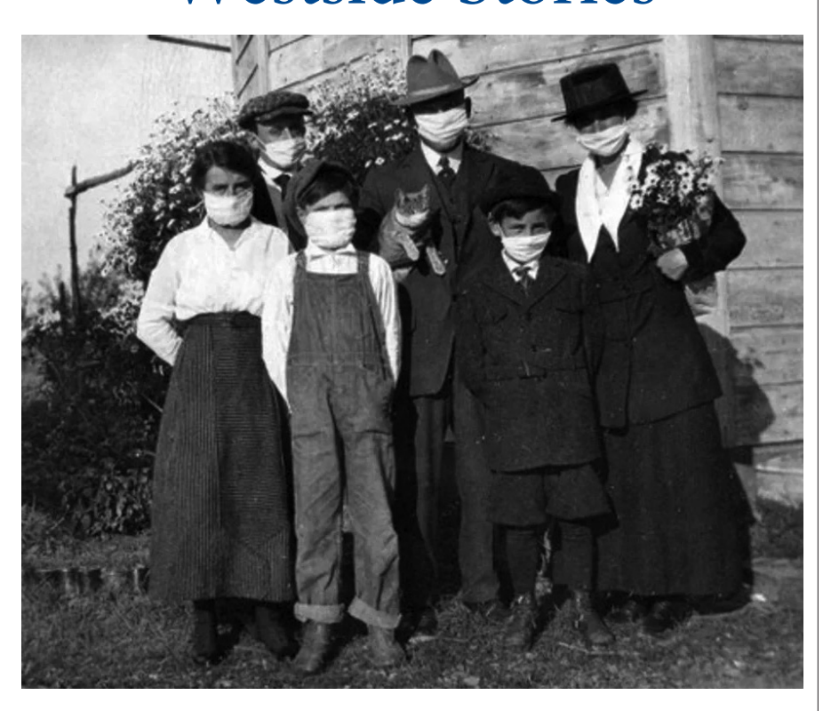
By Michael Harris

any persons today compare the social disruption of Covid 19 with the problems of 1918 when the Spanish Flu was rampant. About 675,000 died as a result of the Spanish Flu which is a number that we can all hope will not be approached in these times by the novel corona virus. One of the major steps taken to battle the flu in 1918 was the closing of public schools. Just as it is now controversial it was so also in 1918. A study done in 2007 by the University of Michigan Medical School which considered the affects of school closure on the epidemic, concluded that closing schools earlier and for a longer period