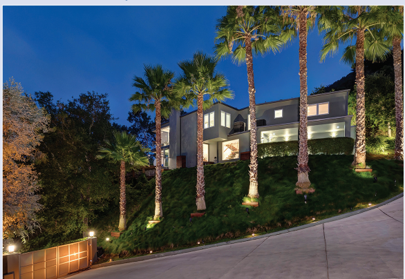
2041 Desford Drive $4,895,000 5 Bed / 4.5 Bath 3,219 Sq. Ft.

Mere moments from the Beverly Hills Hotel yet a world away from the busy city, find your peace in this gorgeous sanctuary of a modern home. High ceilings, open floor plan, absolutely private and nestled within the natural beauty of surrounding hillsides and lush foliagethis property exudes peaceful, quiet solitude. The outdoor space is a vast patio deck created from limestone and Brazilian Ipe wood. The home is situated behind a mechanical gate with a long, winding driveway and has room to park at least eight cars. Utterly secluded with not a neighbor in sight yet just a stone's throw to the trails and open landscape of Franklin Canyon, this beautiful home could be yours today.