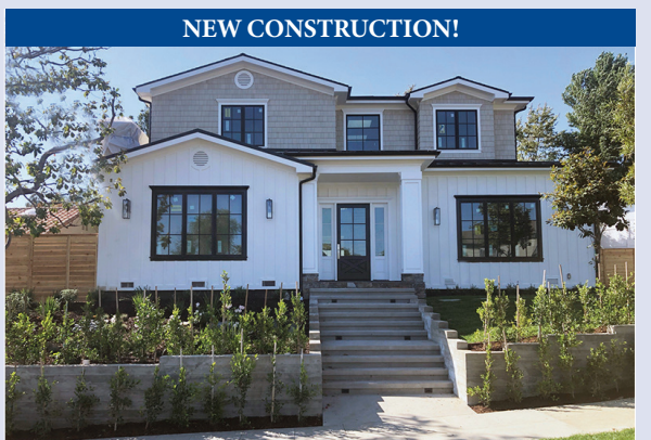
3021 Club Drive $4,495,000 5 Bed / 5.5 Bath

Asophisticated take on the classic modern farmhouse, this absolutely gorgeous new construction is a feast for the eyes and senses. Built by one of Cheviot Hills' most trusted and highly regarded builders, Bob Skibinski, no expense was spared in creating this stunning home. Wide planked wood floors, detailed moldings and designer fixtures add to the property's richness in detail and the open floor plan makes it feel spacious and grand. This home benefits from truly unique design details and an unparalleled craftsmanship that can't be fully appreciated until you witness it for yourself. Be sure and visit today!