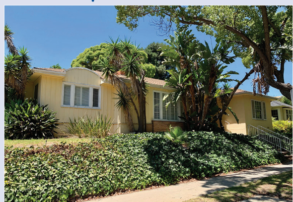
1929 Hillsboro Avenue $1,995,000 3 Bed / 2 Bath / Den 2,303 Sq. Ft., 7,771 Sq. Ft. Lot

Asprawling, mid-century home on an expansive, 7,700+ sq ft corner lot in Beverlywood, this 3 bedroom/2 bath 2,303 sq ft house is surrounded by foliage and steeped in character. Crown moldings, bay windows and wainscoting are just a few of the adornments that bring personality to the home. The kitchen and breakfast nook are bright and cheerful yet updates are most likely needed to bring it up to today's standard of luxury living. This home offers spacious bedrooms, huge laundry room with access to the backyard, a cozy den with decorative fireplace, wet bar and built-ins. There is an old Hollywood-esque vanity/dressing area that leads into the master bedroom. The secluded backyard has a partially covered patio, privacy trees and mature rose bushes. The structure of this grand family home is strong and its layout is well suited for today's active family. A bit of vision and handful of cosmetic alterations will restore this much loved home to its natural grace and beauty.