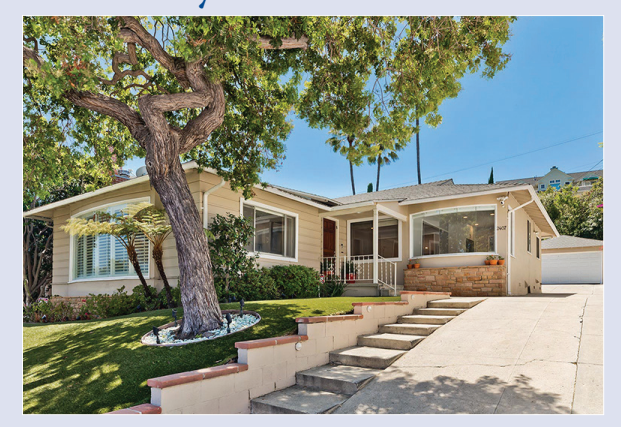
2407 Bagley Avenue $2,175,000 3 Bed / 3 Bath + Guest House 2,245 Sq. Ft., 6,924 Sq. Ft. Lot

Recently remodeled traditional that embodies true Southern California living. Bay windows flood the interior with light and the new, sandy hued hardwood floors mesh with the soft grey-toned walls. Open floor plan ensures an easy flow between the living room, dining, den and kitchen, ideal for entertaining. Brand new kitchen includes white quartz countertops, stainless appliances and breakfast nook. Family room has a bar and offers sliding French door access to the backyard. Gorgeously remodeled bathrooms. Master suite has an in-wall electric fireplace, large walkin closet and French doors that lead out to the backyard. Outdoors you'll find a nice combination of brick patio space and grass. Castle Heights Elementary. "Smart" home in that functions are controlled by phone or tablet, recessed LED lighting, mechanical security gate, laundry room with new washer/dryer, Nest climate control, Ring cameras and alarm system, new single slab quartzite decorative fireplace in the