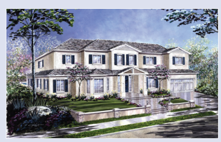
Imagine an idyllic oasis in the heart of Cheviot Hills. Featuring brand new, top-of-the-line construction that is setting the standard of excellence for homes in our area. This work of art (in progress) from Diamond West Distinctive Homes promises to be nothing short of exquisite. A grander expression of the Traditional style and set back but flush with the street allowing for access with ease, the beauty of this nearly 5700 Sq Ft, 6 Bedroom / 7 Bath home will stun you from the onset. This property will be nothing short of an architectural triumph that will make any family proud to call home.

2921 Cavendish Dr – Offered at <sup>$</sup>5,250,000