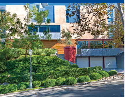
2788 Monte Mar Terrace – $6,495,000

6 Bed/ 8 Bath 7,374 Sq. Ft. 10,521 Sq. Ft. Lot