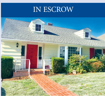
9110 David Avenue – $1,299,000

With a beautiful view of the golf course beyond, this modern and minimalist 3 bedroom/3 bath home in Cheviot Hills embraces its inhabitants with both peace and tranquility. The formal dining room has a balcony and view of the neighborhood's teetops. The unique, Poggenpold edisgned kitchen utilizes all the stainless appliances an at-home chef has come to expect including Mide, Wolf and Subzero appliances, yet the aesthetics offered here are unique and all its own. Custom wood cabinetry, midnight black granite countertops, oversized island and window wrapped breakfast nook with banquette seating will make preparing and enjoying meals a welcome respite from restaurant dining. This level of the home also has an additional bedroom, currently used as an office with a view. Wholly private and impeccable mother-in-law's suite complete with kitchenette, walk-in closet, storage room, bathroom and access to the two car garage with laundry facility. With a strong emphasis on style as much as function, this simply glorious home in the award winning Overland School District is precisely what you've been looking for!