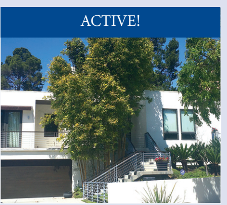
10377 Monte Mar - $3,395,000

Considered to be one of the most prestigious properties in all of Cheviot Hills, this impressive 7,374 square feet architectural masterpiece has many astounding attributes. The Claes Oldenberg inspired sculpture of a giant flower pot sets the tone for this modern style estate, in which every square inch of livable space has been thoughtfully utilized in the most intelligent way. An elevator and central staircase unites each of the four floors, harmonizing the living and certain as proposed by the construction of this custom designed home has been thoughtfully considered and executed with the highest quality craftsmanship. Three car garage, two fireplaces and incomparably pristine city views, this is the absolute statement home of the neighborhood.