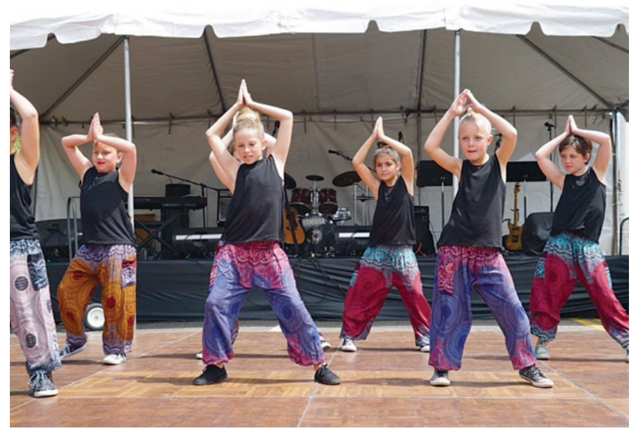
Dancers from DanceTree