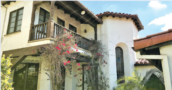
2742 Forrester Dr – $2,625,000

5 Bed / 5 Bath 3,842 Sq. Ft., 7,444 Sq. Ft. Lot