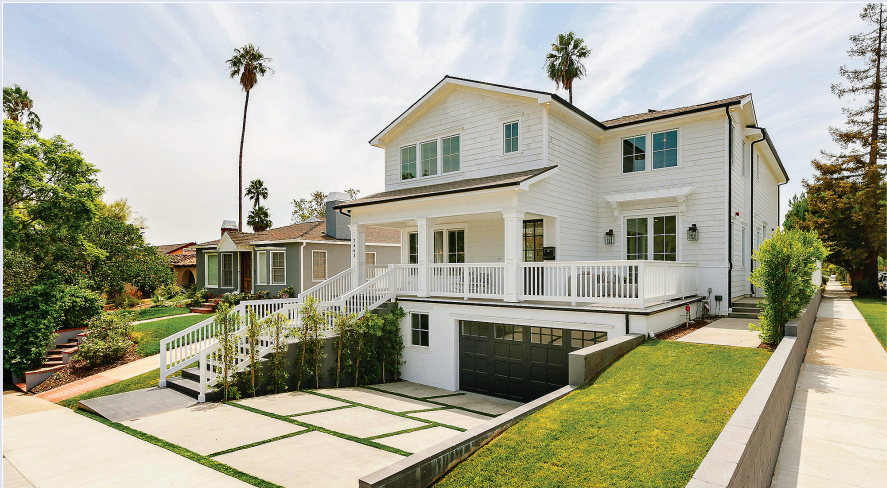
2463 Patricia Ave – $3,995,000 6 Bed / 8 Bath

A Nantucket-style showplace, newly built with unparalleled craftsmanship and an incomparable view of the Rancho Park Golf Course is a true neighborhood gem. An extra wide entryway leads to an open floor plan in which the formal living room, glass enclosed wine room and dining room seamlessly blend into a cohesive, shared space. Stylishly designed and fully functional for a busy family, the kitchen offers stainless appliances and a marble countertop island. Located in the highly coveted Overland Elementary School district with convenient proximity to the shops and restaurants of Pico Boulevard, this inspired home is a perfect example of how a property can effortlessly combine style, function, comfort and class.