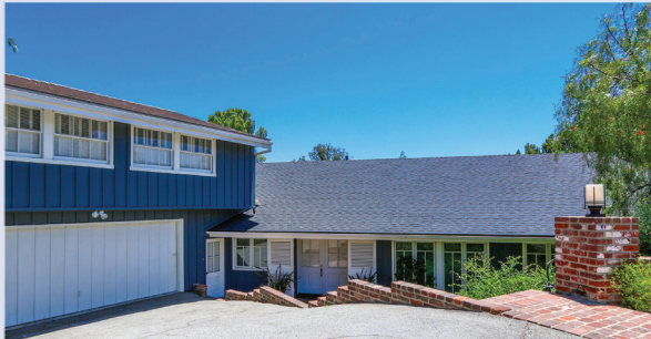
500 Hanley Pl – $2,999,000