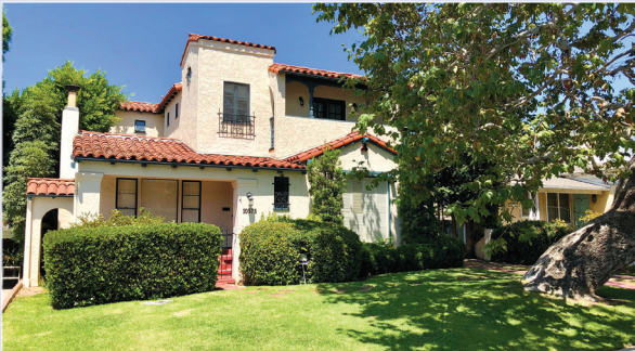
10575 Cushdon Ave – $2,299,000

4 Bed / 3 Bath 2,949 Sq. Ft., 6,253 Sq. Ft. lot