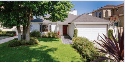
10523 Dunleer Dr – $2,250,000