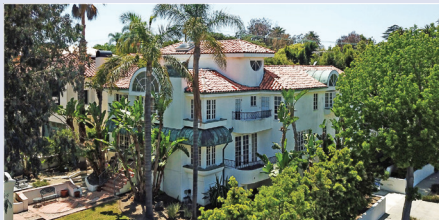
3035 Queensbury Dr – $2,999,000