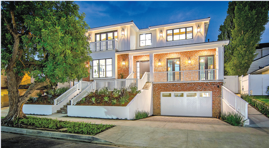
2250 Guthrie Circle – $6,795,000 8 Bed / 10 Bath 9,068 Sq. Ft., 8,564 Sq. Ft. lot

An impressive estate unlike any other, truly masterful in design and construction, this home in Beverlywood marries form with function in an incomparable, glorious union. From the first step beyond the front door, the expanse of space coupled with meticulous attention to detail is awe-inspiring. Three levels perched high above the street, the formal living room with marble fireplace and private front office both have views of the tranquil street below. Outside you'll find absolute privacy: trees envelop the space that includes grass, a covered patio and a large, sparkling swimming pool. With additional design features that combine effortlessly to present a one-of-a-kind, state of the art home unlike any other on the market today.