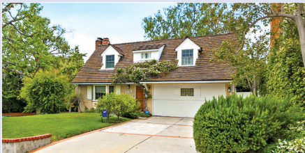
2751 Motor Ave – $2,195,000