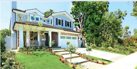
2715 Forrester Dr – $4,999,000