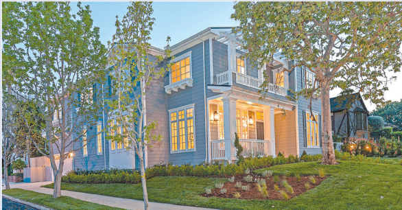
10452 Lorenzo Place – $4,855,000

5 Bed / 7 Bath 4,449 Sq. Ft., 7567 Sq. Ft. Lot