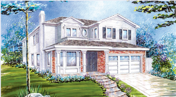
2719 Forrester Drive – $5,199,000