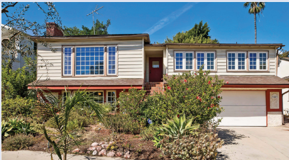
9447 Beverlywood St – $1,995,000

3 Bed / 3 Bath 2,400 Sq. Ft., 8,399 Sq. Ft. lot