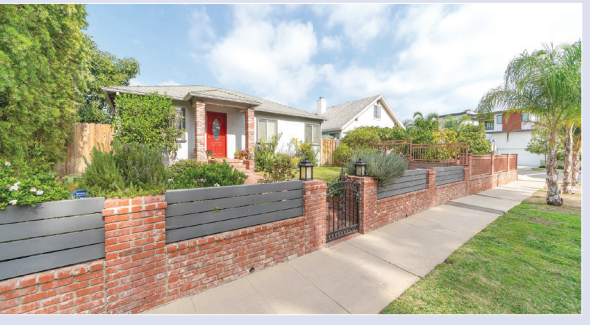
10637 Northvale Rd - $1,549,000

4 Bed / 2 Bath 1,500 Sq. Ft, 6,233 Sq. Ft. Lot