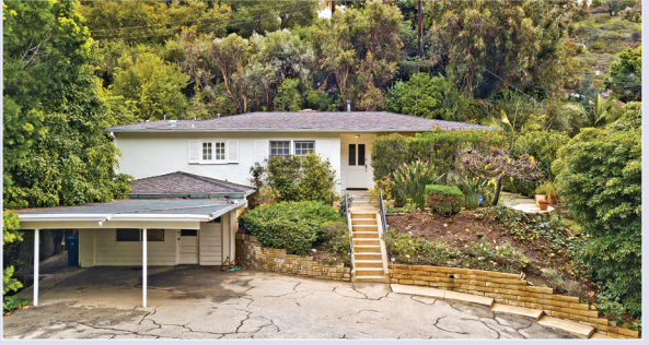
1578 Benedict Canyon Dr - $1,395,000