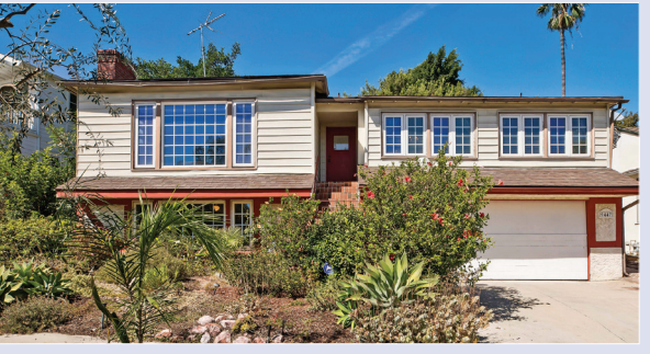
9447 Beverlywood St - $1,840,000

3 Bed / 3 Bath 2,400 Sq. Ft., 8,399 Sq. Ft. Lot