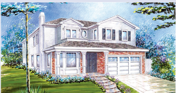
2719 Forrester Drive - $5,199,000