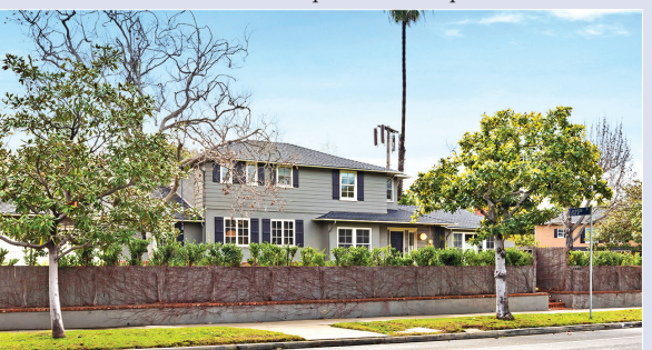
2880 Motor Ave - $2,995,000

4 Bed / 4 Bath 3,660 Sq. Ft., 11,922 Sq. Ft. Lot