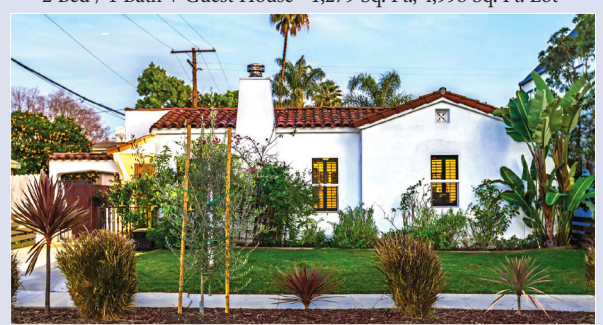
2912 S Beverly Dr - $1,199,000

2 Bed / 1 Bath + Guest House - 1,279 Sq. Ft., 4,998 Sq. Ft. Lot