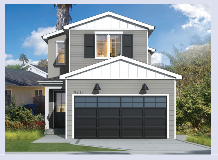
3217 Castle Heights Ave - $1,895,000 4 Bed / 3 Bath - 2,041 Sq. Ft., 6,494 Sq. Ft. Lot

A pristine, brand new construction has so much to offer. Clean lines accentuated by light hardwood floors gives the home a modern feel and the desirable open floor plan creates a sense of breadth and movement throughout the entire space. The kitchen, with its sophisticated slate grey Cesar Stone countertops, designer pendants over the island and stainless steel appliances that are fanciful as well as functional. The kitchen and great room with fireplace open up to the extraordinarily vast backyard. Kids and pets alike can run for hours on the flat expanse of grass, completely privatized by maturing foliage.