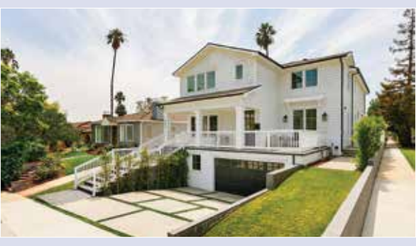
2463 Patricia Ave - $3,995,000

Beverlywood - IN ESCROW 8 Bed / 10 Bath 9,068 Sq. Ft., 8,564 Sq. Ft. lot