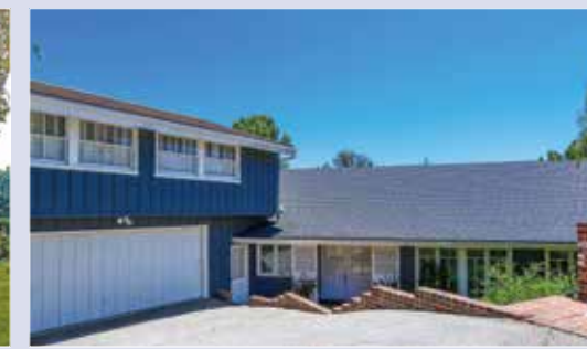
500 Hanley Pl - $2,999,000