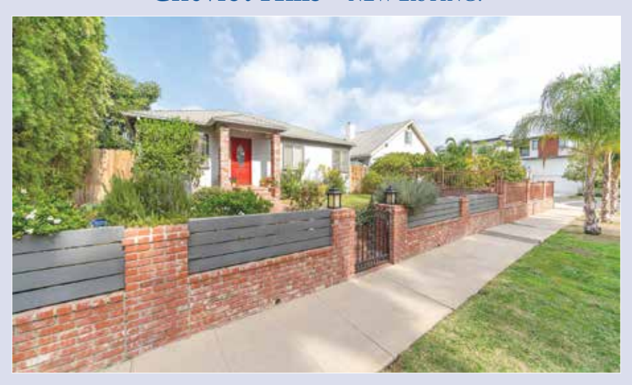
10637 Northvale Rd - $1,579,000 4 Bed / 2 bath 1,500 Sq. Ft, 6,233 Sq. Ft. lot