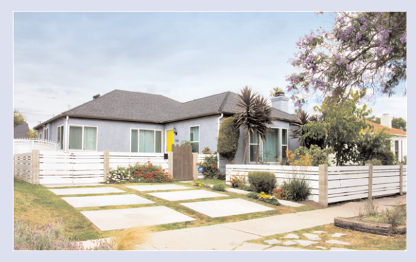
An oasis in the city. This gorgeous 3 BR / 2 BA home features gleaming hardwood floors throughout, a spacious dining area that flows seamlessly into the perfectly updated kitchen. The master bedroom is a peaceful retreat with large master bath and jetted tub. The remaining 2 bedrooms aree spacious and share the updated bath with double vanity and separate shower and tub. The living room / den area is situated in a way that could facilitate a FOURTH Bedroom! The yard boasts the perfect set up for gardening out front and entertaining in the back on the deck or grease varies. grassy yard.