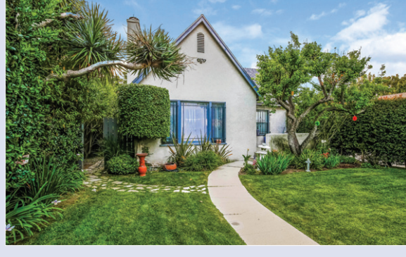
Come behind the ultra-private hedges for a rare treat in Castle Heights: an utterly charming English inspired cottage with separate, rental or guest property in the back. The front house offers all hard wood floors, coved ceilings, cozy fireplace, formal dining room, built-ins, an updated kitchen, laundry room and 2 spacious bedrooms and 2 pristine bathrooms with designer flourishes. Separated by the grassy and manicured backyard, the back apartment also has much to offer! Perched a top the 3 ar ome behind the ultra-private hedges for a rare treat in Castle Heights: an utterly charming English garage, this one bedroom//one bathroom apartment includes a lovely kitchen with stylish black/white tiled floor, pretty view from the bedroom and comfortable back patio. Located near shops, restaurants and the award winning Castle Heights Elementary School, this is a rare opportunity not to be missed.