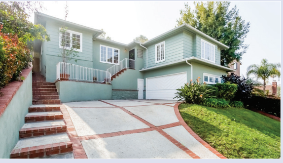
An enchanting property, perched above a quiet and family friendly street in Beverlywood, this 3 bedroom/2.5 bath home offers many features iconic to homes of this era without compromising modern day conveniences. We invite you to be charmed by the home's intricate crowned moldings, hardwood floors, original light fixtures, marble fireplace and beautiful views. The three bedrooms and bathrooms are large and comfortable, closets in the bedrooms are built?in, including Italian designed Polyform Custom closets in the master. French doors connect the master bedroom to the ultrafyrivate backyard, ideal for entertaining thanks to a variety of seating areas and built?in fire pit. A spacious room downstains' (with attached half bath) can be used for a number of purposes: gym, office, housekeeper or guests. With central air/heat, a two?ar grange,living room surround sound, and a multitude of closets and storage capabilities, this comfortable family house in the award winning Castle Heights School district is just waiting for you to move right in.