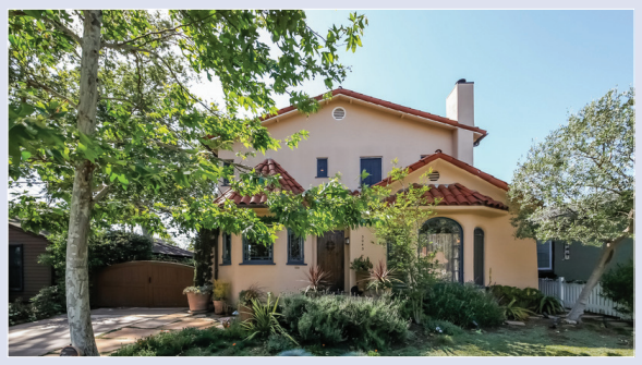
Inspired by the lush tapestry of Tuscany's countryside, step into this home and experience a bit of Italy in the heart of IBeverlywood. Mixing elements of original artistry with modern improvements, this four bedroom/three bathroom home offers equisite examples of how to live beautifully al Italia. From the Batchedder tiled fireplace and paned, arched bay windows in the living room, to the richly landscaped, Medic-like fruit trees in the backyard... every detail in this hand painted, two story, hard wood floored home exudes romance. Built in 1928 and recently remodeled to create more space, modern features include an upstaria laundry facility, an enormous master suite with an adjacent room that could double as a nursery, gym or office. The tastefully decorated suite also has a large walk-in closet and steam shower in the master bath. This home has recessed lighting, designer built-ins for art and media, a usable attic for extra storage, generously sized bedrooms and doests, a spacious breakfast nook with beautiful views and a kitchen that offers every necessary anemity for the at-home chef, eager to whip up a delizioso pasta pesto. Located on a family friendly street, just a storeds throw from the award winning Castle Heights Elementary School, this much loved house is just waiting to welcome you home. spired by the lush tapestry of Tuscany's countryside, step into this home and experience a bit of Italy in the heart o