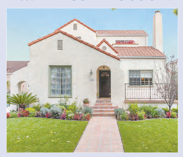
2562 Kelton Avenue – Offered at $1,399,000