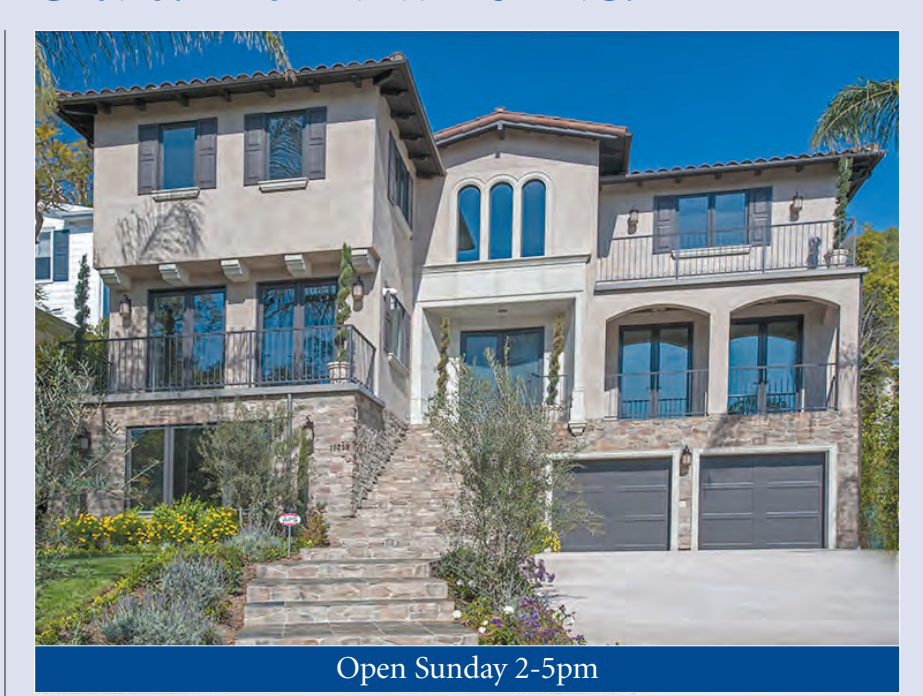
10259 Monte Mar Drive – Offered at $4,399,000

hat comes to mind when you picture your ideal home? Does it overlook a tranquil golf course, a welcome respite conveniently located next to all of life's necessities? Does its state-of-the-art kitchen have every culinary convenience for today's modern chef? Are there romantic balconies and terraces that extend the indoor spaces to reach outside? Are there views from every room? Does your dream home have a 4-car garage? A bathroom for every bedroom? An elevator to carry parcels from the ground floor up? A vast, resort-like backyard that flows seamlessly from outdoor living and sun bathing poolside to the golf course beyond? Is it a short stroll to a park, tennis courts, shops and restaurants? This is one home that truly earns the distinction of having it all.