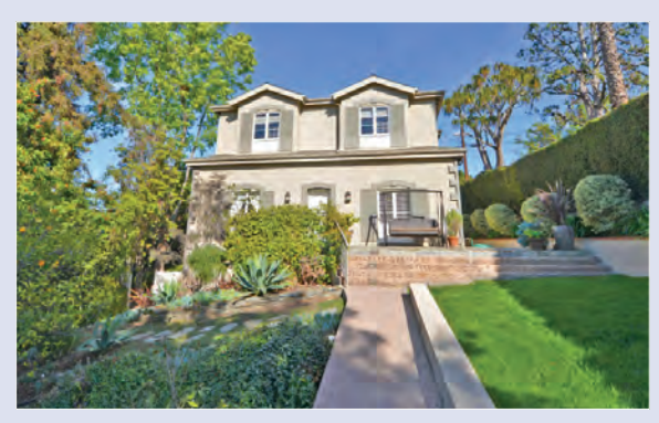
2910 Patricia Avenue – Offered at $2,295,000

separate eat-in breakfast room reminiscent of English conservatories. Also included on this level of the house is the laundry room, family room/den and office. These two spaces, however, could easily convert into additional bedrooms as they each come equipped with generous closets. The second story of this traditional style home was part of the major architectural overhaul that was undertaken by the current residents. Roughly 1700 of the 3500 square feet were added to make the home comfortable for a growing family. The upstairs bedrooms each possess high ceilings, glorious views and extremely large closets. Two bedrooms have handsome built-in bookshelves as well as romantic window seats, ideal for curling up with a novel. The master bedroom is worthy of the King and Queen of the manor. A vast space with far reaching views, enormous walk-in closet, beautiful bathroom with limestone tiled floors, marble countertops, Jacuzzi bathtub, dual headed steam shower and double vanity. There is also an additional area off the bedroom that could be used for an office, gym, additional closet or even a nursery. Located in the award winning Overland School district, this five bedroom, four bath is the epitome of a truly exquisite and quite regal residence in a picturesque pocket of Cheviot Hills.