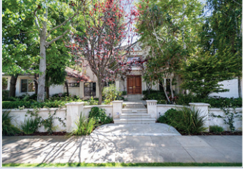
2715 Forrester Dr Listed for $4,199,000