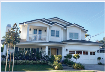
3309 Barbydell Dr Sold Off Market - Represented Buyer