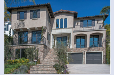
10259 Monte Mar Dr Sold Over Asking in 4 Days