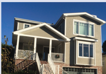
10568 Putney Rd Sold Off Market - Represented Buyer & Seller