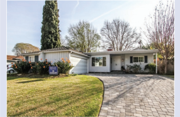
9720 Beverlywood St Sold Over Asking