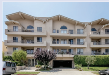
1457 Reeves St #104 Sold Over Asking