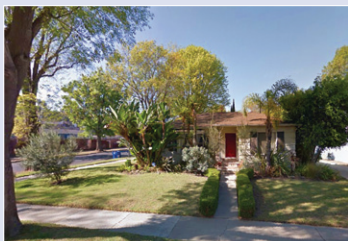
2731 Castle Heights Pl Represented Buyer