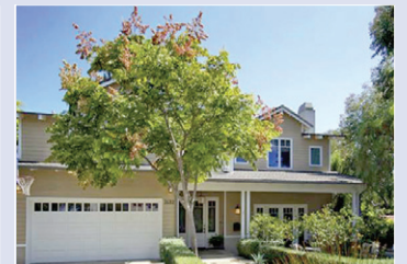
2602 Aiken Ave Represented Buyer