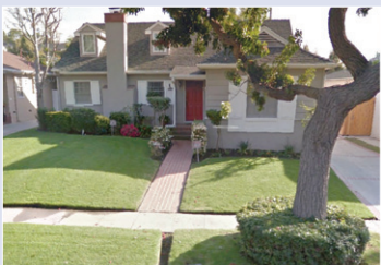
9610 Oakmore Rd Sold Off Market - Represented Buyer & Seller