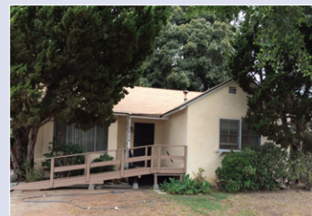
10707 Esther Ave Listed for $965,000