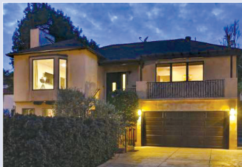
10585 Butterfield Rd Represented Buyer