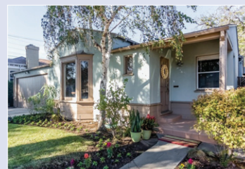
8963 W 25th St Sold Over Asking