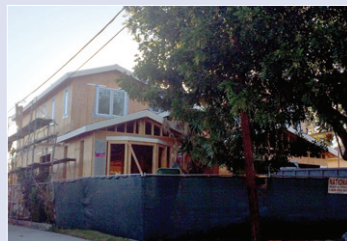
9214 Beverlywood St Sold Off Market