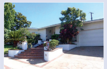
3350 Barbydell Dr Represented Buyer