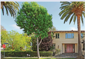
2890 Forrester Dr Sold Off Market