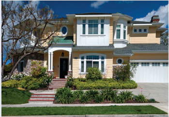
2933 Danalda Dr Listed for $3,799,000