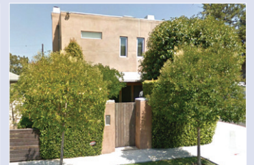
3354 S Beverly Dr Listed For $899,000