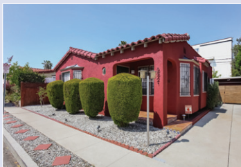
8821 David Ave Listed for $675,000