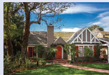
3083 Patricia Ave Represented Buyer