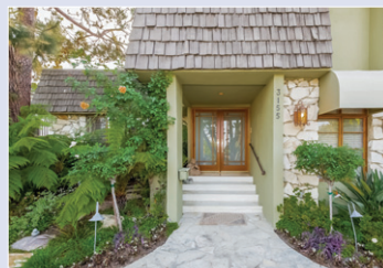
3155 Shelby Dr Listed for $1,599,000