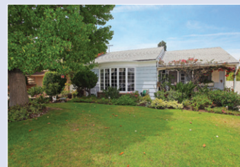
9031 David Ave Listed for $1,199,000