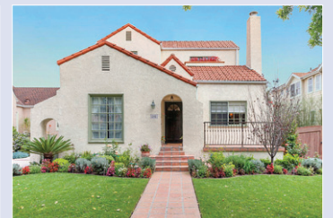
2562 Kelton Ave Sold Over Asking