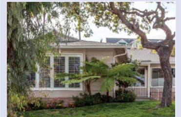
2407 Bagley Ave Represented Buyer