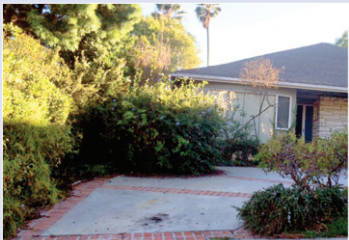
10016 Cheviot Dr Sold Off Market - Represented Buyer & Seller