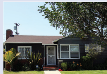
2923 Cardiff Ave Sold Off Market