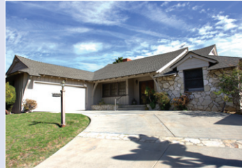
3036 Danalda Dr Sold Over Asking