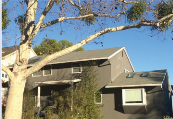
2820 McConnell Dr Sold Off Market - Represented Buyer