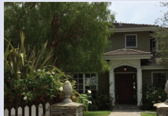
10336 Dunleer Dr Represented Buyer