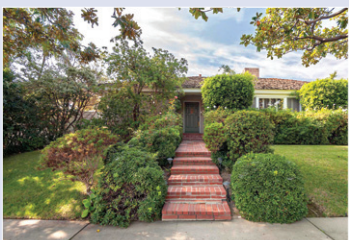
2921 Cavendish Dr Sold Off Market For Over Asking Represented Buyer & Seller