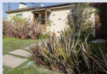
8951 Hargis St Sold Over Asking