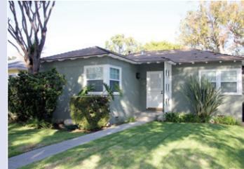
2734 Veteran Ave Sold Over Asking