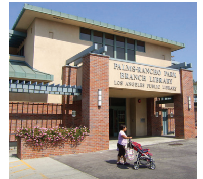
Palms-Rancho Park Library 2920 Overland Ave. Los Angeles, Calif., 90064 www.lapl.org

owns a property that is unoccupied, then it would be a benefit to caution him or her to be vigilant because a person could take possession and then claim an ownership interest even without a deed. This could come as an unexpected surprise by the title owner or his family.