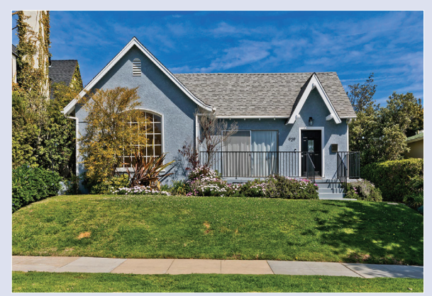
929 16th St $2,495,000 5 Bed / 4 Bath 2,601 Sq. Ft., 7,405 Sq. Ft. Lot

Seller may finance!!!! Live just moments from the beach and feel the cool ocean breezes from either unit of this pristine Santa Monica duplex. Each offers hard wood floors, comfortably sized rooms, closets and living spaces, immaculate kitchens with stainless appliances and oversized windows that let natural light stream into each home. Each unit also offers a wholly private and beautifully landscaped backyard, perfect for summer barbeques or evening cocktail parties. Located in one of the most enviable sections of Santa Monica: nestled an arm's reach between the chic shops and restaurants of Wilshire and Montana Avenue, this unbelievable opportunity is not to be missed. Both units delivered vacant at the close.