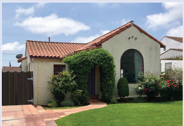
9112 Gibson St $1,290,000 3 Bed / 2 Bath 1,264 Sq. Ft., 5,001 Sq. Ft. Lot

Adelightful Spanish style home on one of the friendliest streets in Beverlywood. The front door, a magical patchwork of color, sets the tone for what exists beyond: a picturesque and private front courtyard that leads to the main property. Inside you'll find all the special characteristics that give this architectural style such unique charm: thick adobe walls, curved archways, coved ceilings, hardwood floors and crystal doorknobs. Located in the award winning Castle Heights school district and a short stroll from the fun shops and restaurants of South Robertson, this house will not be on the market for long so make a point to see it today.