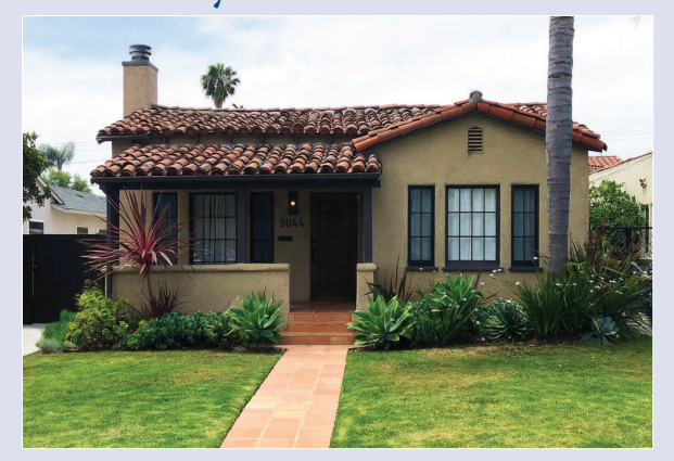
9044 Gibson St $1,549,000 3 Bed / 2 Bath + Guest House 1,428 Sq. Ft., 5,004 Sq. Ft. Lot

charming Spanish style on one of the friendliest streets Ain Beverlywood, this home exudes warmth and style at every turn. An impeccably landscaped front yard with a walkway of Spanish tile paves the way toward the house and from the first step over the threshold, you feel transported to old Mexico. A stone fireplace anchors the formal living room that is punctuated by thick adobe walls, coved ceiling and intricate archways. French doors lead to the front patio courtyard which allows the living room to be basked in natural light. With richly hued hardwood floors throughout, there is an easy flow between living room to formal dining room to the bright and spacious kitchen. Step outside and feel like you are on the private deck of a fancy hotel, with cushy outdoor seating and bistro patio lights dangling above to complete the mood. And Castle Heights Elementary School is a stone's throw from the fun shops and restaurants of South Robertson. Come see it for yourself!