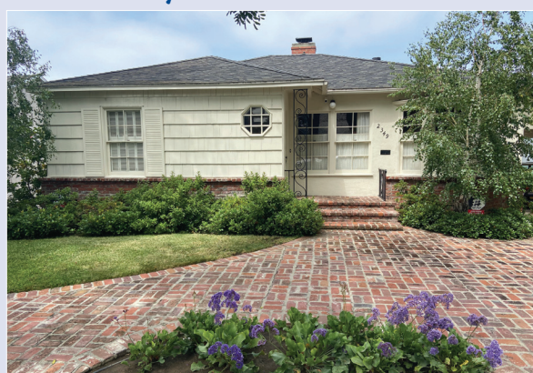
2349 Castle Heights $1,500,000 2 Bed / 2 Bath / Den 1,334 Sq. Ft., 5,279 Sq. Ft. Lot

classic and elegant home on a highly desirable tree-Alined street in Beverlywood, exudes grace, style and sophistication. Mature landscaping and brick walkway in the front yard adds to the home's enviable curb appeal. Inside you'll find hardwood flooring in warm hues, a formal living room with romantic fireplace and front windows that let in an abundance of natural light. There is an artful bay window in the formal dining room that leads to the remodeled kitchen. Sparkling clean and an efficient use of space, the kitchen offers granite countertops, stainless high-end appliances, convenient center island and a dazzling array of storage. Each bedroom is quite large with ample closets and the bathrooms are clean and updated with modern fixtures and finishes. Located in the award winning Castle Heights Elementary school district and surrounded by warm and friendly neighbors, this is one house you definitely need to see!