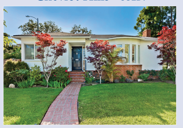
3009 Castle Heights Ave $1,399,000 3 Bed / 2 Bath 1,546 Sq. Ft., 5,022 Sq. Ft. Lot

Acheerful, traditional style home with exquisite landscaping on a large corner lot ideal for raising a family. Design details include intricate crown moldings, hardwood floors, Bay window with Plantation shutters and stately fireplace in the formal living room. The three bedrooms are large and comfortable- a Murphy bed allows flexibility to easily convert one bedroom into an office. A short stroll to sweet neighborhood park and situated in the award winning Castle Heights Elementary School district, this attractive home will make its next inhabitants happy for years to come.