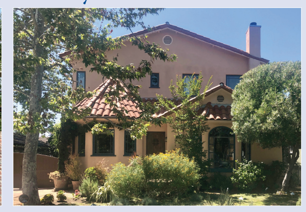
3043 Oakhurst Ave $1,799,000 4 Bed / 2.5 Bath 2,163 Sq. Ft., 5,000 Sq. Ft. Lot

Inspired by the lush tapestry of Tuscany's countryside, step into this home and experience a bit of Italy in Beverlywood. From the Batchelder tiled fireplace and paned, arched bay windows in the living room to the richly landscaped backyard, every detail in this newly painted, two story, hardwood floored home exudes romance. Built in 1928 and remodeled to create more space, features include: an enormous master suite with walk-in closet, master bath with steam shower plus an adjacent, sun-filled room that could double as a conservatory, nursery, gym or office. The private backyard is an idyllic paradise with mature fruit trees, new garden deck, cascading Bougainvillea and a storybook walkway that leads to the converted garage/artist's studio, nestled within a canopy of greenery and foliage. Located on a quiet, friendly street in the award winning Castle Heights Elementary School district, this home is a true neighborhood gem that deserves your immediate attention.