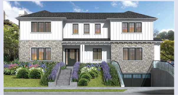
- GLENBARR - Best Location in the Neighborhood! 6 Beds/TBD Bath 7,500 Sq. Ft., 8,500 Sq. Ft. Lot

You may be curious about the new construction homes being built on Glenbarr and Lorenzo. Call Ben (310-704-6580) or send him an email ( ben@benleeproperties.com ) to learn more about these spectacular properties that will undoubtedly be the crown jewels of the neighborhood.