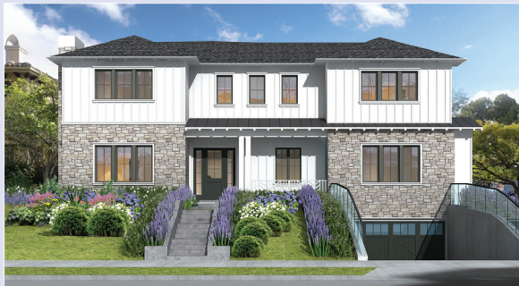
- GLENBARR - Best Location in the Neighborhood! 6 Beds/8 Bath 7,500 Sq. Ft., 8,500 Sq. Ft. Lot

You may be curious about the new construction home being built on Glenbarr. Call Ben tel:3107046580 or send him an email mailto:ben@benleeproperties.com to learn more about this spectacular property.