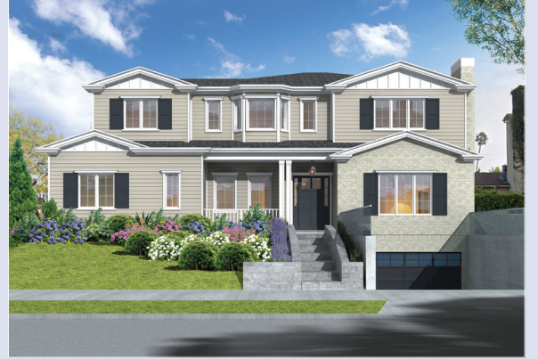
- LORENZO - Best Location in the Neighborhood! 6 Beds/8 Bath 7,500 Sq. Ft., 8,500 Sq. Ft. Lot

You may be curious about the new construction home being built on Lorenzo. Call Ben tel:3107046580 or send him an email mailto:ben@benleeproperties.com to learn more about this stunning property.