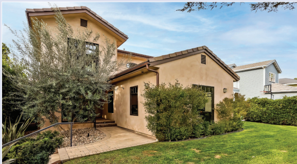
3029 Motor Ave $2,999,000 5 Beds/5 Bath 3,010 Sq. Ft., 6,985 Sq. Ft. Lot

Seize the unique opportunity to be the second owners of this luxurious home that is less than a decade old. State-of-the-art craftsmanship and fine attention to detail created this stately 5 bedroom/5 bath exquisite estate in Cheviot Hills. Surrounded by lush foliage and totally private, this immaculate home in the highly coveted Overland Avenue School District must be seen to be believed!