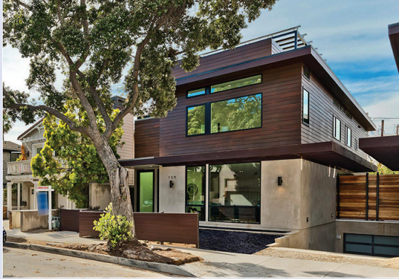
141 Hollister Ave for lease at $30,000/month 5 Beds/6 Baths 5,000 Sq. Ft.

Steps from Prime Santa Monica Beach! Gorgeous new 2020 construction, state-of-the-art masterpiece mere moments from the beach. Approx. 5,000 sq. ft. open floor plan allows an easy flow from Great Room to formal dining to magnificent entertainer's kitchen that includes top tier Wolf and Subzero appliances and over-sized island. The kitchen opens to the sophisticated and drought-resistant landscaped backyard. There are sliding pocket doors that completely open to an outdoor side deck dining area, ideal for parties al fresco. This ground level of the home also has a guest room and powder room. Downstairs features guest room, laundry room, gym/media room, kitchenette, an enormous storage room and access to the 3-car subterranean garage. Second floor with 3 en suite bedrooms + laundry rm. Luxe master has treetop views, walk-in closet and 5-star bath. 900 sq. ft. rooftop deck with firepit and hot tub.