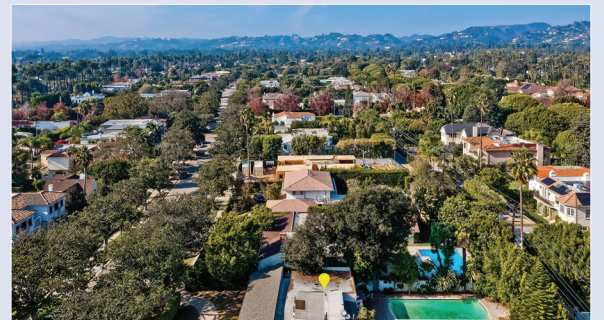
514 N Camden Dr $6,995,000 3 Beds/3 Baths 2,639 Sq. Ft., 12,859 Sq. Ft. Lot

Seize this rare opportunity to create your dream home on one of the most enviable streets in Beverly Hills. The jewel of the crown is the land: a vast 12,859 square foot flat lot with a world of limitless potential. With creativity, vision and the power of artistic architectural imagination, your fantasy of designing and building a state-of-the-art home in the most luxury zip code in America can soon become a reality