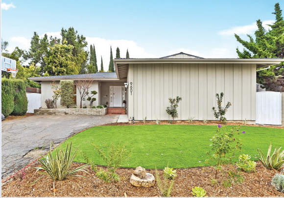
9601 Cattaraugus Ave $7,950 per month 3 Beds/2 Bath

This warm and inviting home in the Castle Heights neighborhood of Beverlywood has much to offer. Immaculate, remodeled and tastefully designed, there is a dramatic fireplace in the formal living room and hardwood floors throughout provide an effortless flow from each vast and generously sized room. The bedrooms have large closets with convenient built-ins for additional storage and one bathroom in particular has been totally remodeled with the added bonus of a European style super shower. The kitchen, a vision in black and white, provides an ideal entertaining space with oversized central-island, stainless high-end appliances and large pantry. With mature foliage surrounding the drought resistant backyard, enjoy dinner outdoors while enjoying absolute privacy. There's a beautiful deck and new trellis. Located mere moments from the award winning Castle Heights Elementary School, this home is a must-see.