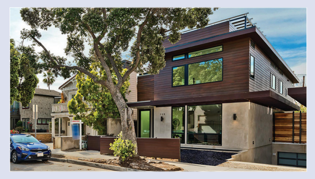
141 Hollister Ave for lease at $30,000/month 5 Beds/6 Baths 5,000 Sq. Ft.

Steps from Prime Santa Monica Beach! Gorgeous new 2020 construction, state-of-the-art masterpiece mere moments from the beach. The kitchen opens to the sophisticated and drought-resistant landscaped backyard. There are sliding pocket doors that completely open to an outdoor side deck dining area, ideal for parties al fresco. Luxe master has treetop views, walk-in closet and 5-star bath. 900 sq. ft. rooftop deck with firepit and hot tub.