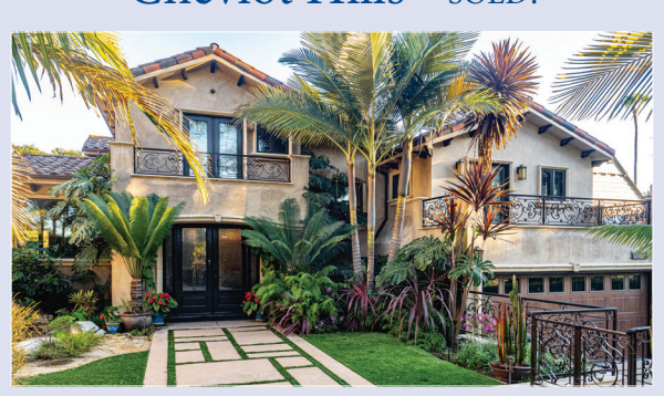
10440 Lorenzo Pl $4,995,000

4 Beds/5 Bath 4,585 Sq. Ft., 9,001 Sq. Ft. Lot