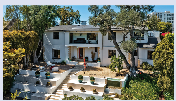
1323 Club View Dr Offered For Lease Furnished or Unfurnished $28,000/month

6 Beds/7 Baths 4,839 Sq. Ft. - 11,742 Sq. Ft.