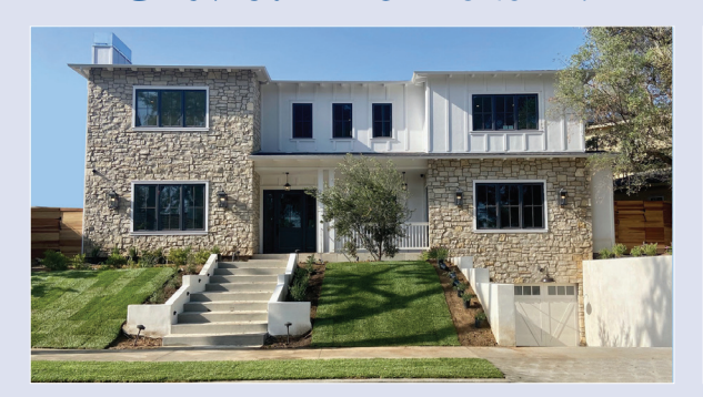
- GLENBARR - Best Location in the Neighborhood!

6 Beds/8 Bath 7,500 Sq. Ft., 8,500 Sq. Ft. Lot