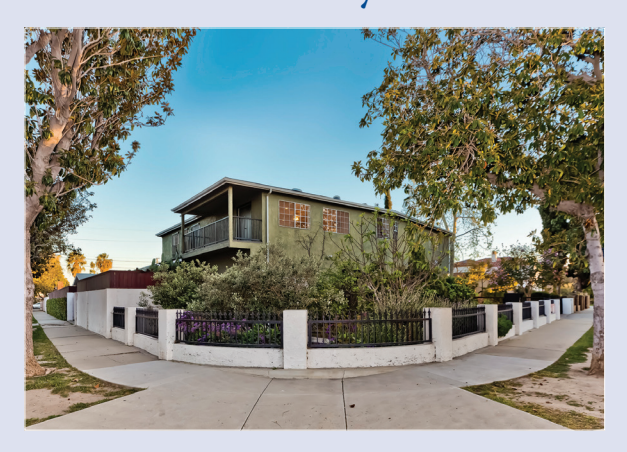
4275 Corinth Ave $2,650,000 4 Beds/4 Bath 3,763 Sq. Ft., 11,388 Sq. Ft. Lot

Situated on a massive corner lot in a quiet Culver City neighborhood. Surrounded by an orchard of mature trees that include guava, avocado, pomegranate and a variety of citrus, the foliage provides both privacy and farm-to-table nourishment. The house has a vast entertaining space on the entry level as well as convenient/private office scenarios for those who opt or need to work from home. With limitless appeal in an enviable location conveniently located near the shops, restaurants and studios of Culver City, seize this phenomenal opportunity to reimagine a true showplace.