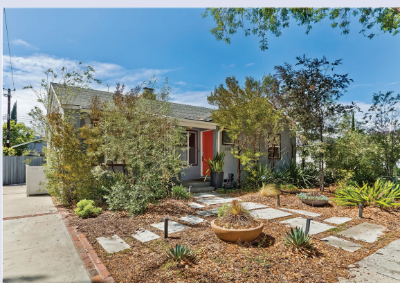
2339 Castle Heights Ave $7,500/Month 3 Beds/2 Bath 1,703 Sq. Ft., 5,209 Sq. Ft. Lot

horoughly updated home for lease on Castle Heights has everything you've been looking for! With a fully remodeled kitchen, this property offers all new infrastructure (heat/ac system, pipes, windows, closets) as well as artistic touches that are sure to appeal to your discerning eye: polished hardwood floors, large marble fireplace, plenty of open space and light. Located on a lovely tree-lined street in a family friendly neighborhood just a stone's throw to the award winning Castle Heights Elementary, this is an