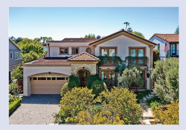
2848 Motor Ave $4,695,000 5 Beds/4.5 Bath 4,246 Sq. Ft., 7,485 Sq. Ft. Lot

An extraordinary property in Cheviot Hills: with the glamour and design of a palatial estate without sacrificing the warmth and charm of a beloved family home, this stately Mediterranean is a masterpiece of craftsmanship and detail. Additional amenities of this beautiful home include: Sonos central smart panels to control tv, sound system, lighting located in the family room, impossibly high ceilings, sweeping views, multiple fireplaces, front balconies and generous storage space. A truly exquisite property that will