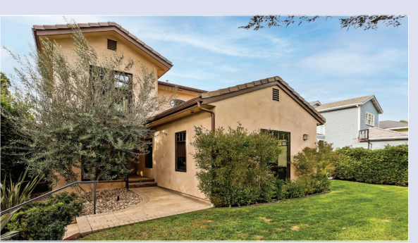
3029 Motor Ave $2,999,000

5 Beds/5 Bath \, 3,010 Sq. Ft., 6,985 Sq. Ft. Lot