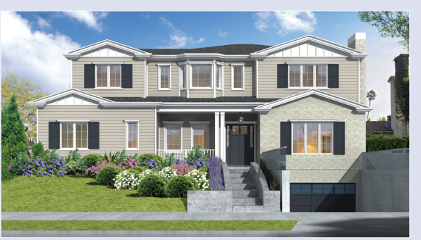
- LORENZO -Best Location in the Neighborhood!

6 Beds/8 Bath 7,500 Sq. Ft., 8,500 Sq. Ft. Lot