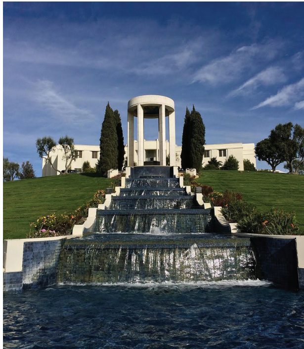
Waterfall and Al Jolson monument at Hillside Memorial Park

I mentioned the famous African American architect Paul Revere Williams in this month's feature article. Another interesting fact about Williams that appears in More Westside Stories: he designed the enormous 75 ft. tall domed structure and waterfall, a memorial to entertainer Al Jolson that is the cornerstone of Hillside Memorial Park and Mortuary (you've passed it every time you