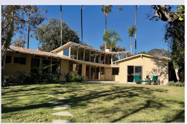
3142 Queensbury Dr $7,900 per/mo. 3 Beds/3 Bath - 2,319 Sq. Ft., 9,749 Sq. Ft. Lot