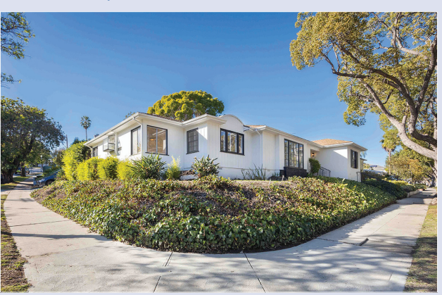
1929 Hillsboro Ave $9,000 per/mo. 3 Beds/2 Bath - 2,303 Sq. Ft., 7,771 Sq. Ft. Lot