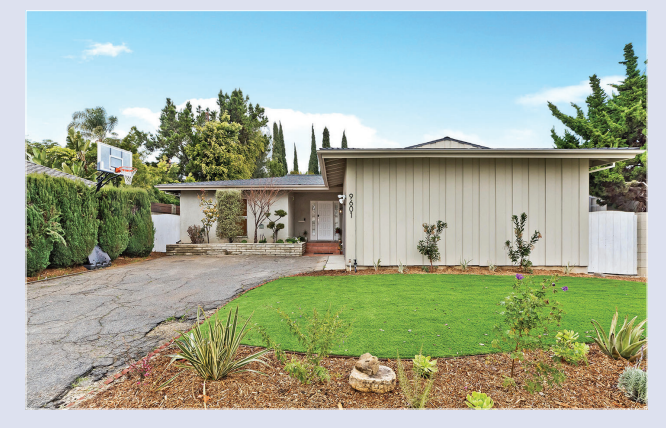
9601 Cattaraugus Ave $7,950 per/mo. 3 Beds/2 Bath - 1,941 Sq. Ft., 7,945 Sq. Ft. Lot