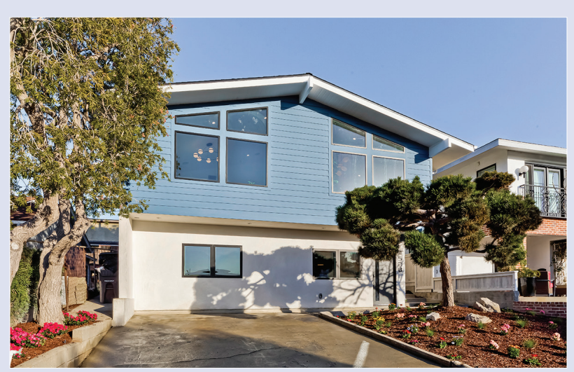
3528 Walnut Ave $3,195,000 5 Beds/3.5 Bath - 2,790 Sq. Ft., 4,645 Sq. Ft. Lot

Mere moments from the shore and a stone's throw from the shops and restaurants of Manhattan Beach, this home has just completed top-to-bottom renovations. Everything from floors to finishes is brand new and particular attention has been paid to a meticulous design aesthetic that is as classic mid-century as it is fresh for today's most stylish occupants. Located in the award winning Manhattan Beach School District and nestled in a beautiful, family-friendly neighborhood, this is an opportunity not to be missed.