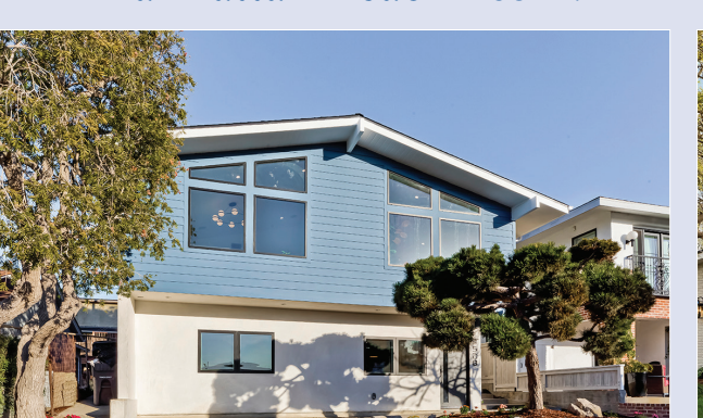
3528 Walnut Ave $3,195,000 - List Price 5 Beds/3.5 Bath - 2,790 Sq. Ft., 4,645 Sq. Ft. Lot