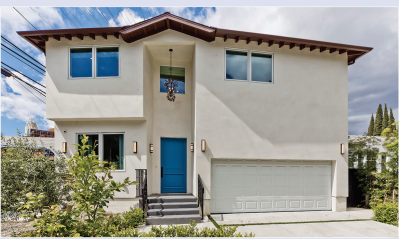
1153 S. Clark Drive $12,995.00 p/mo. 4 Beds/4.5 Bath - 3,000 Sq. Ft., 6,249 Sq. Ft. Lot