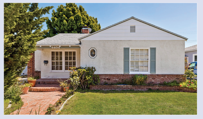
6404 W 85th St $1,199,000 2 Beds/1 Bath - 1,153 Sq. Ft. Lot