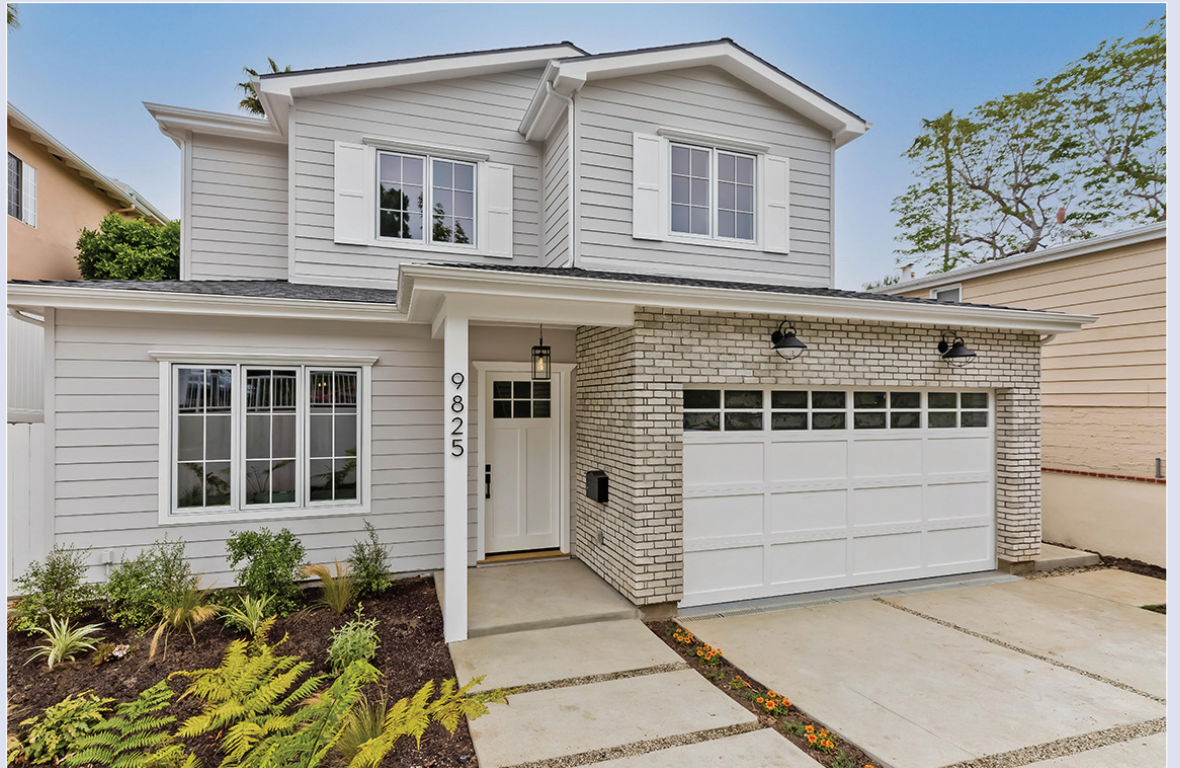
9825 Altman Ave - $3,995,000 5 Beds/5.5 Bath 3,539 Sq. Ft., 6,677 Sq. Ft. Lot