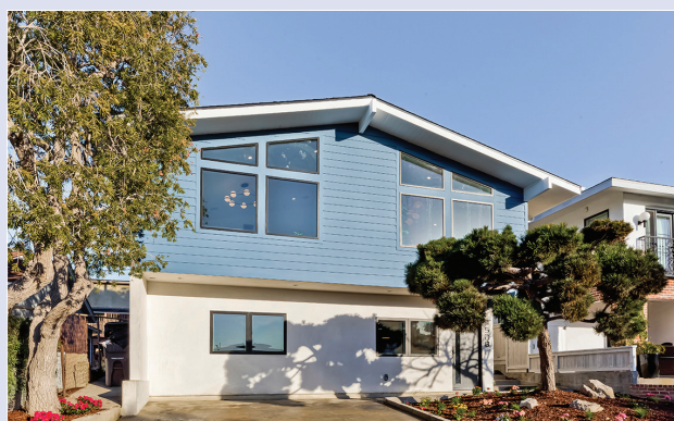
3528 Walnut Ave $3,195,000 - List Price 5 Beds/3.5 Bath - 2,790 Sq. Ft., 4,645 Sq. Ft. Lot