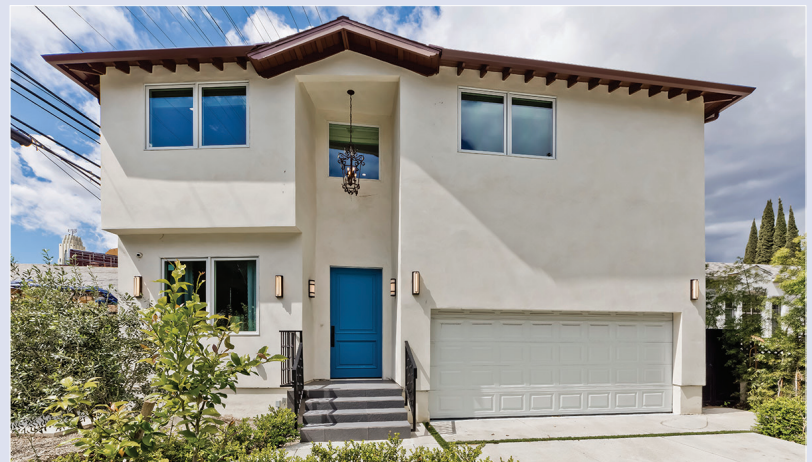
1153 S. Clark Drive $11,995.00 p/mo. 4 Beds/4.5 Bath - 3,000 Sq. Ft., 6,249 Sq. Ft. Lot