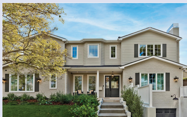
10422 Lorenzo Pl $25,000 per/mo. 6 Beds/6 Bath - 6,600 Sq. Ft., 8,100 Sq. Ft. Lot