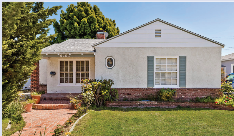
6404 W 85th St $1,199,000 2 Beds/1 Bath - 1,153 Sq. Ft. Lot