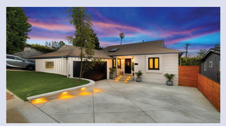
3316 Shelby Drive - $2,849,000

4 Beds/4.5 Bath 2,586 Sq. Ft., 5,678 Sq. Ft. Lot