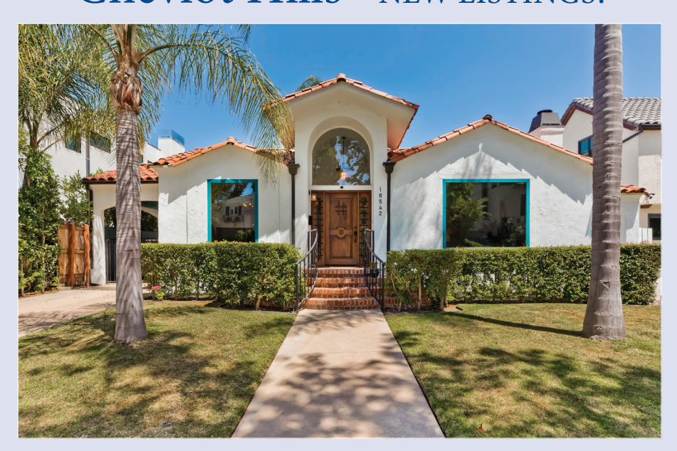
10542 Butterfield Rd. - $2,349,000

3 Beds/2.5 Bath 2,000 Sq. Ft., 5,753 Sq. Ft. Lot