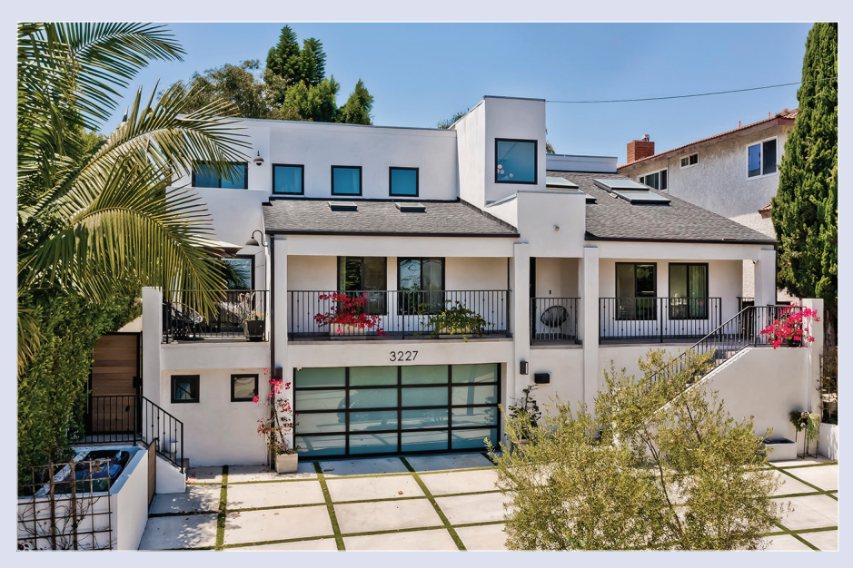
3227 Shelby Drive - $4,595,000

4 Beds/4.5 Bath 3,875 Sq. Ft., 10,168 Sq. Ft. Lot