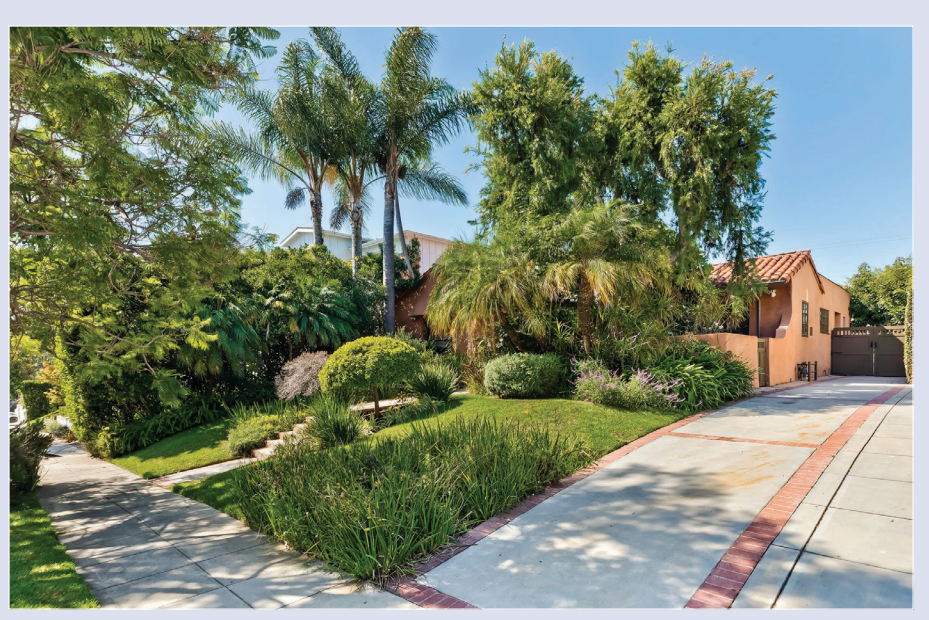
10547 Dunleer Dr - $2,100,000