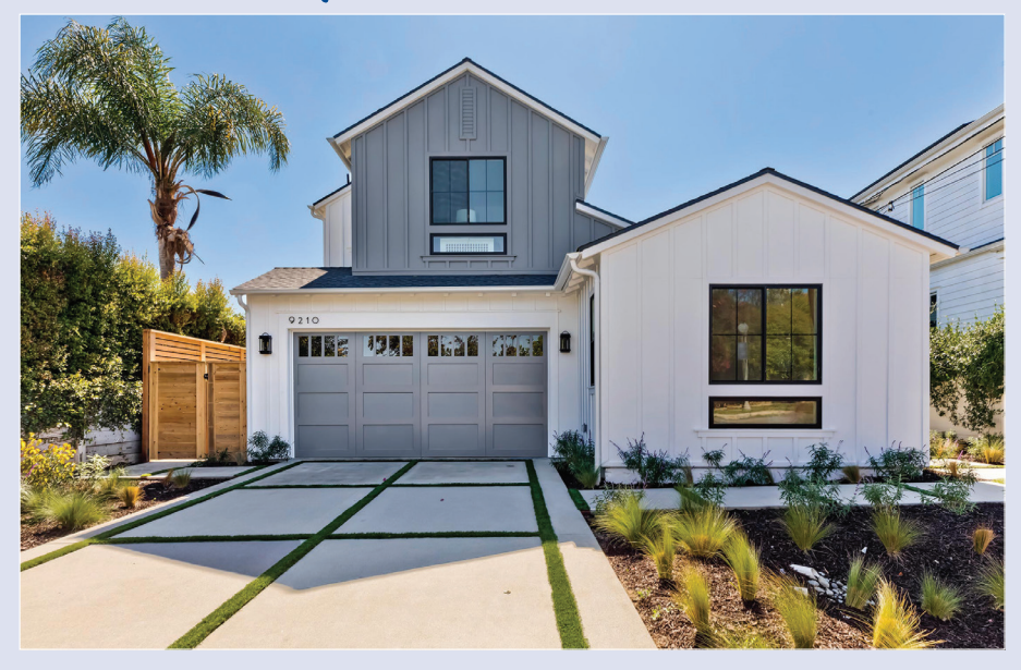
9210 Beverlywood Street - $3,595,000