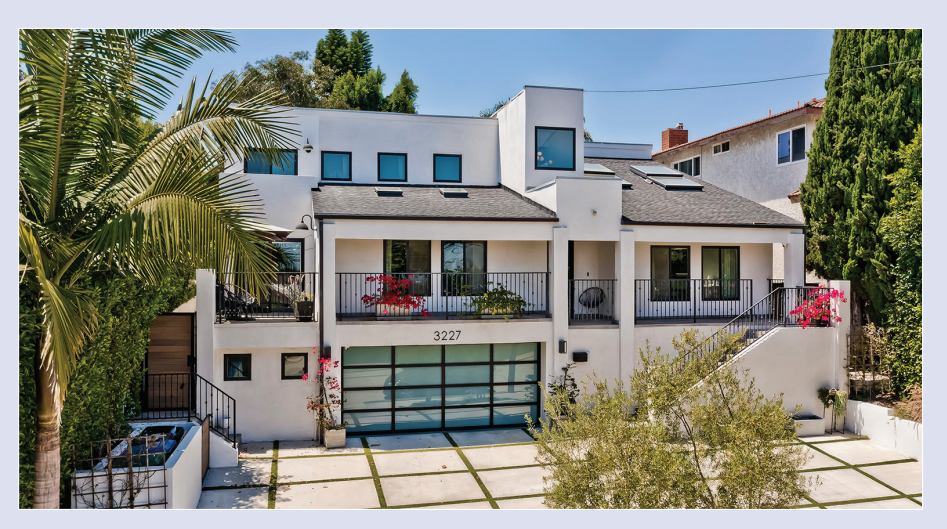
3227 Shelby Drive - $4,295,000