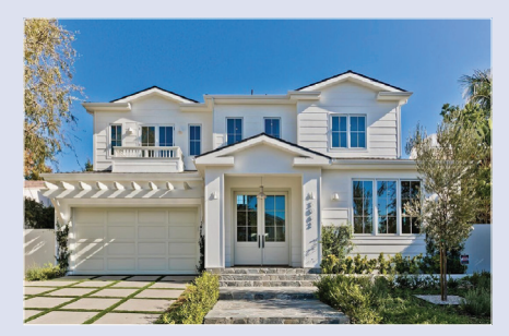
2856 Forrester Dr. - $8,495,000

UNDER CONSTRUCTION Disclaimer: image is used for illustrative purposes only and may not be exact representation of the final product.