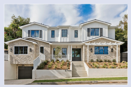
664 Kingman Ave - $9,995,000

UNDER CONSTRUCTION Disclaimer: image is used for illustrative purposes only and may not be exact representation of the final product.