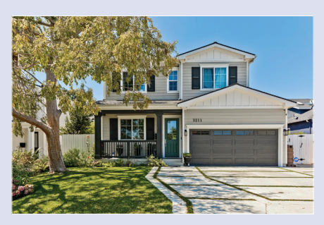
3211 Castle Heights Ave. -

5 Beds / 4 Bath, 2971 Sq. Ft., 8750 Sq. Ft. Lot