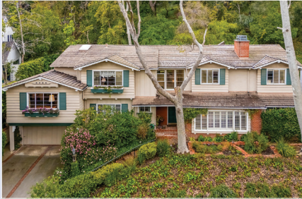
619 Tuallitan Rd. - $3,850,000 6 Beds / 5 Bath, 4066 Sq. Ft.

Nestled within the tranquil canyon beauty of an idyllic cul-de-sac, this traditional 6 bedroom/5 bath home north of Sunset in Brentwood exudes familial warmth at every turn. Remodeled to accommodate a growing family while maintaining the integrity of the original architectural design, this 4066 sq ft home offers an abundance of space without sacrificing cozy comfort. The formal living room has a stately marble fireplace and front-facing windows that bathe the interior in natural light. The spacious formal dining room, just beyond the kitchen, can accommodate even more partygoers in its intimate sitting area with a brick fireplace – the perfect spot for sipping afternoon tea.