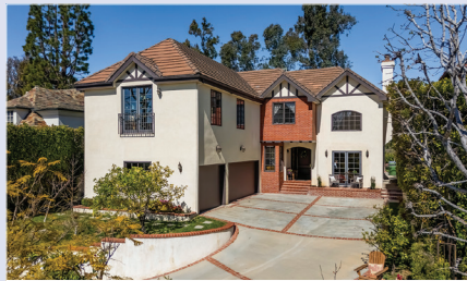
10323 Monte Mar Dr. - $25,000/mo Los Angeles, CA 90064 5 Beds / 5.5 Bath, 4926 Sq. Ft., 8565 Sq. Ft. Lot

Celebrate this magnificent home in prime Cheviot Hills. This elegant property offers 5 Bedrooms and 6 bathrooms with an abundance of social living spaces and the most jaw-dropping view of the golf course imaginable. Located a short distance from the amenities of Century City and Beverly Hills. A home to be seen and admired.