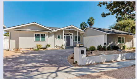
2768 Anchor Avenue - $3,495,000 4 Beds / 4 Bath, 2629 Sq. Ft., 8809 Sq. Ft. Lot

Recently remodeled! Open, spacious, and basked in natural light, this single-story Ranch style home is a breath of fresh air. High, peaked-ceilings, beachy-hued hardwood floors and artistic design details lend the beautiful home an updated and modern flair. Located a stone's throw from the local neighborhood park and walking distance to the award-winning Castle Heights elementary school, this lovely house would make any happy family feel right at home.