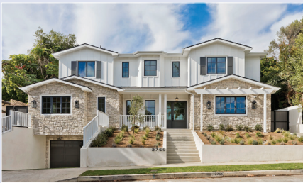
664 Kingman Ave. - $9,995,000