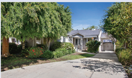
1478 Roxbury Dr. - $1,695,000 2 Beds / 2 Bath, 1435 Sq. Ft.