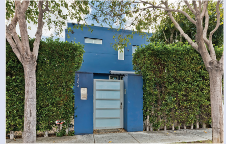
3354 S. Beverly Drive - $1,560,000 3 Beds / 2.5 Bath, 2394 Sq. Ft.

This centrally located, 3 bedroom/3 bath 2394 sq foot home is as stylish as it is functional. Wholly private and safely enconced behind security doors, the home sits upon a drought resistant rock garden and is surrounded by tall hedging and mature foliage. Step inside and see all hardwood floors, a sweeping open floor plan, cozy fireplace in the living room, a dining room and modern kitchen featuring stainless high-end appliances, designer backsplash, Sub-Zero refrigerator, custom cabinetry, prep island and wine storage. A short jaunt nearby Culver City and to Cheviot Hills' local supermarket, Starbucks, beauty salons and more. A private oasis in the heart of the city!