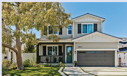
3211 Castle Heights Ave. - $3,095,000 5 Beds / 4 Bath, 2971 Sq. Ft., 8750 Sq. Ft. Lot