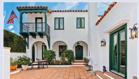
2852 Motor Ave. - $2,995,000 4 Beds / 2.5 Bath, 3255 Sq. Ft., 7308 Sq. Ft. Lot