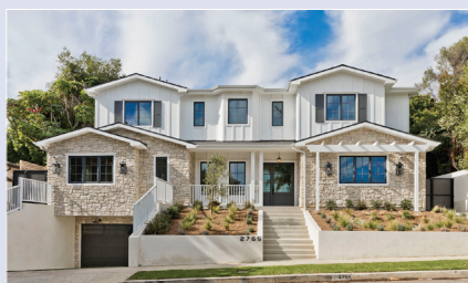
664 Kingman Ave. - $9,995,000