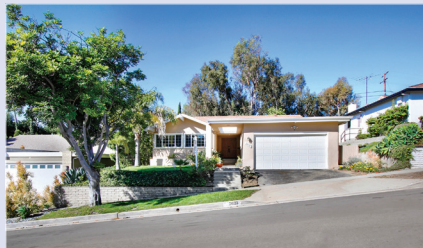
2623 S. Beverly Drive - 3 Beds / 3 Bath, 2467 Sq. Ft. Lease @ $9,000p/mo.

Immaculate traditional style home in Beverlywood. One story convenience with plenty of space and an abundance of natural light. Beautiful stone fireplace and high-pitched, A-frame ceiling in the formal living room. There's a formal dining room that leads to the spacious kitchen. An enviable location in the award winning Castle Heights Elementary School district, this is a great opportunity to live in a lovely, family friendly neighborhood.