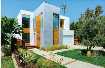
3571 Colonial Avenue - $3,995,000 5 Beds / 7 Bath, 4225 Sq. Ft., 7500 Sq. Ft. Lot