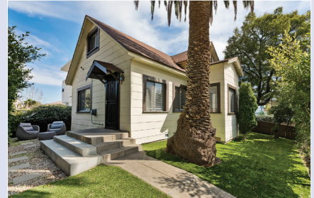
1921 6th Street - $6,000p/mo. 2 Beds / 2 Bath, 1215 Sq. Ft.

A bright and delightful California cottage just a stone's throw from the beach in Santa Monica. An upstairs loft perfect for studying, gaming or playtime, this classic clapboard home offers authenticity at its best. Fully gated and surrounded by privacy hedging around a drought-resistant garden, this home provides hardwood floors in the living room, and plenty of storage spaces. Located near the fun shops and restaurants of Main Street, Santa Monica, and just a short stroll to the famous Santa Monica pier, 3rd Street Promenade, and the Pacific Ocean, this lovely home is an ideal setting for tranquil, seaside living.