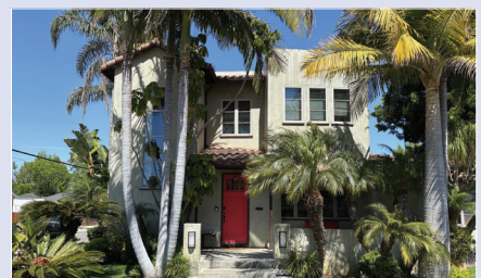
2700 Midvale Ave. - $2,495,000 4 Beds / 3 Bath, 2360 Sq. Ft., 6364 Sq. Ft. Lot