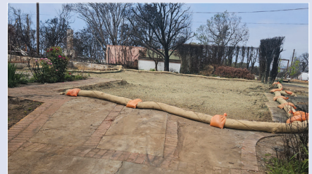
1135 Chautauqua Blvd. - $1,900,000

An opportunity to build your dream home in Pacific Palisades. This property consists of a flat 5,551 sq ft lot with a previous home of 1,563 sq ft, which allows for expedited rebuild permits at approx. 1,719 sq ft. Be able to live near the heart of the Village and help recreate the essence of what was once one of the most cherished communities in Southern California. A rare chance to be a pioneer of the new Palisades.