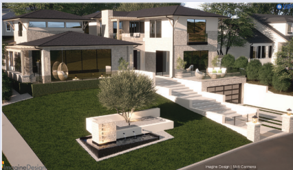
16879 Mooncrest Drive - $5,850,000 5 Beds / 6.5 Bath, 5900 Sq. Ft., 10890 Sq. Ft. Lot Featuring an elevator and a Pool + Spa

A dazzling, brand new construction on a quarter acre lot south of Ventura Boulevard. This home has everything a discerning buyer could want: vast, spacious living spaces; open floor plan, natural light, elegant landscaping and an enormous backyard. A certified Smart Home that offers all the latest in technological advancements, this isn't just a magnificent estate but a true architectural achievement.