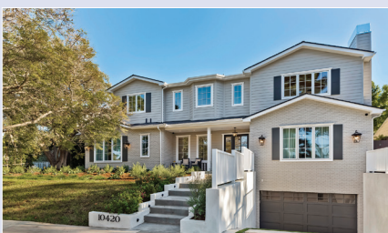
10422 Lorenzo - $8,995,000 6 Beds / 8 Bath