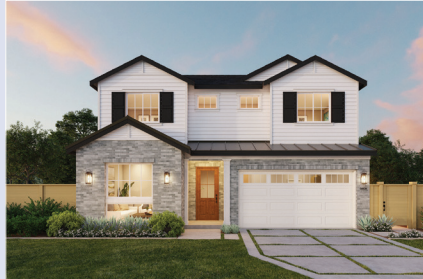
2803 Cardiff Avenue - $4,815,000 5 Beds / 6 Bath, 4382 Sq. Ft., 6763 Sq. Ft. Lot

Nestled in the highly desirable neighborhood, this 2-story traditional home being built by Thomas James Home's offers 4,382 sq ft of luxurious living space. This thoughtfully designed home includes an attached and a detached ADU, providing versatility and additional space. On the main floor, you'll find an attached ADU with both an interior entrance and a private outdoor entrance, perfect for guests or multi-generational living. Conveniently situated just minutes from the vibrant shopping scene in Century City, the cultural hub of Culver City, and the prestigious UCLA campus, this home offers unmatched convenience.